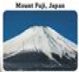
Mount Fuji, Japan