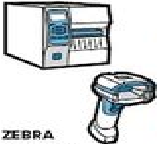
ZEBRA PRINTERS AND SCANNERS