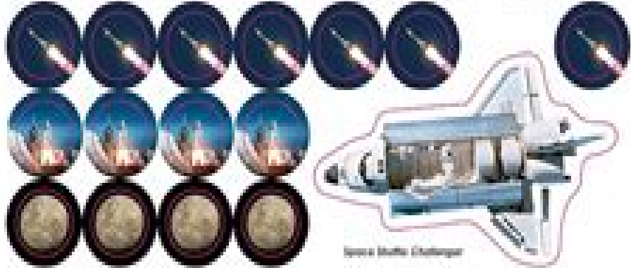
Space Shuttle Challenger