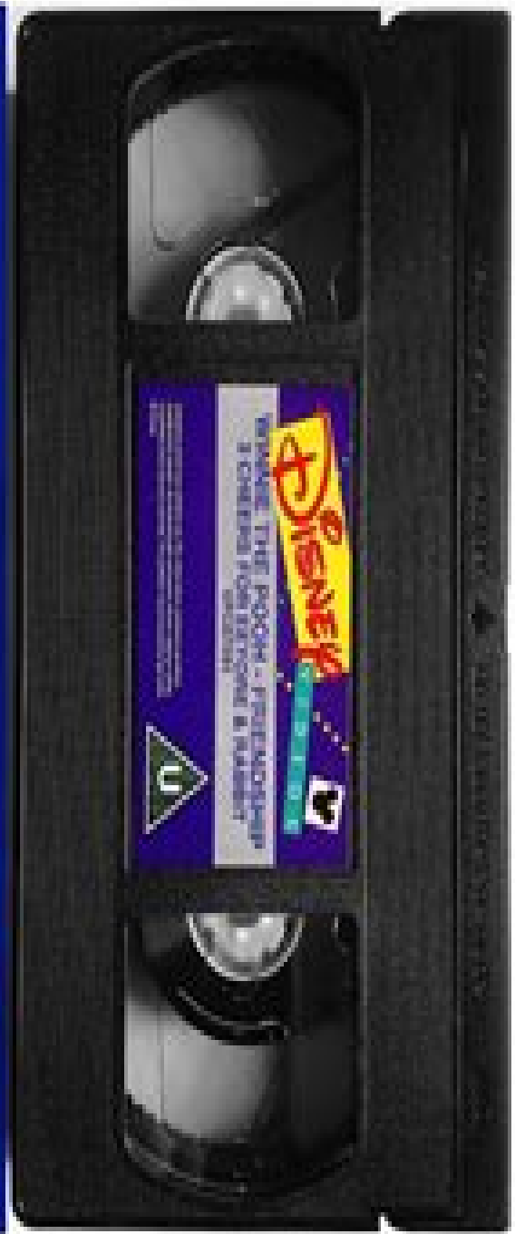
Winnie the Pooh : Friendship 4 – Three Cheers for Eeyore & Rabbit! (D616760 PAL/VHS) (Released by Buena Vista Home Entertainment on 4 th January 1993)