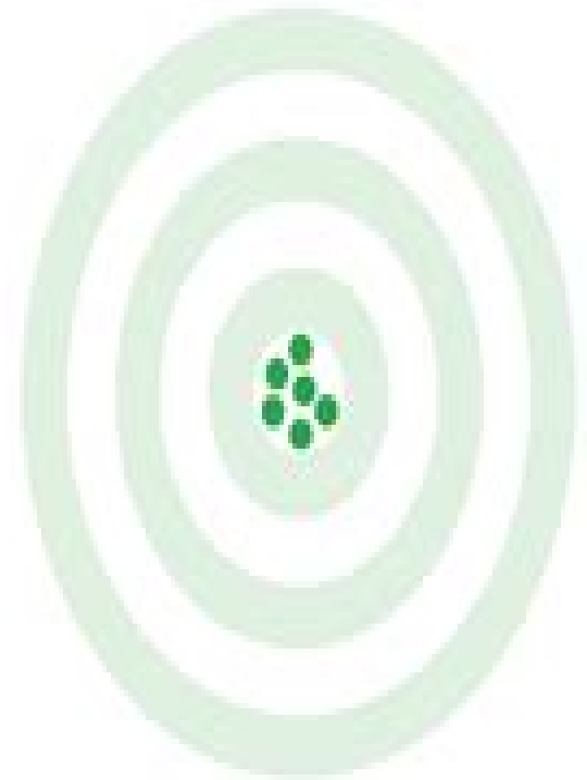
Good validity Good reliability