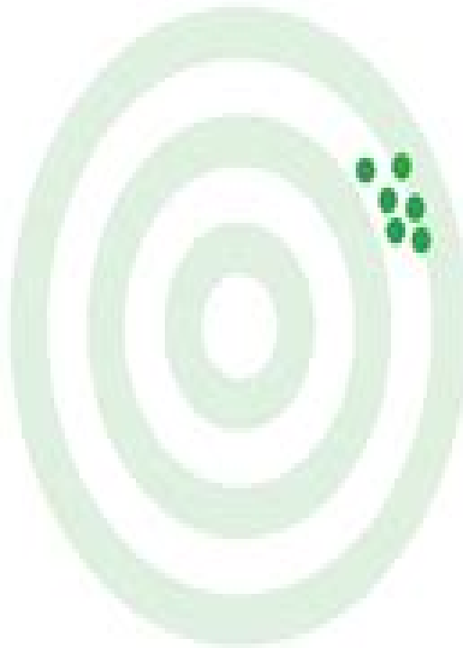
Poor validity Good reliability