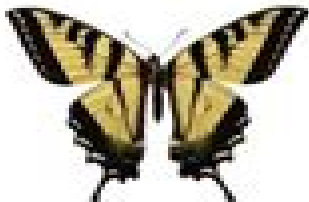
Western Tiger Swallowtail