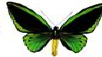
Common Green Birdwing