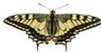
Common Yellow Swallowtail