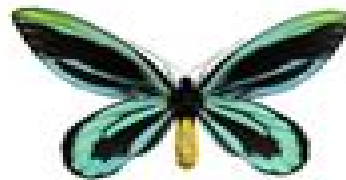
Queen Alexandra's Birdwing