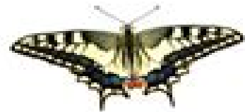
Old World Swallowtail