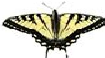
Canadian Tiger Swallowtail