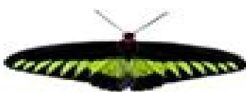
Rajah Brooke's Birdwing