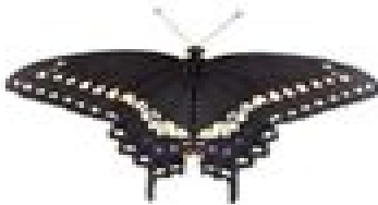
Eastern Black Swallowtail