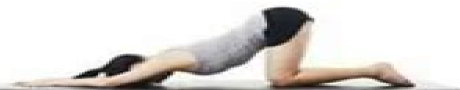
11. Puppy Pose