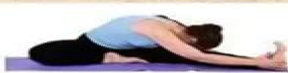
2. Head to Knee Forward Bend