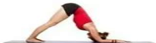
7. Dolphin Pose