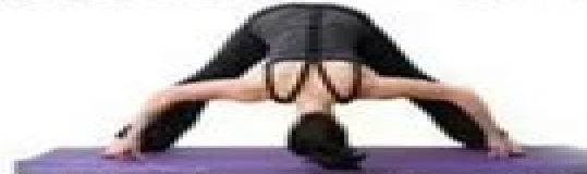
5. Standing Forward Bend Pose