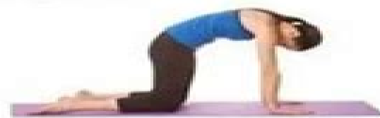
9. Cat Pose