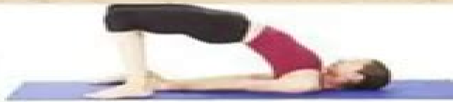
3. Bridge Pose