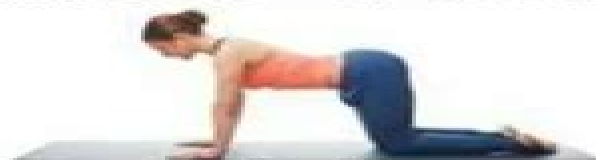
4. Cow Pose