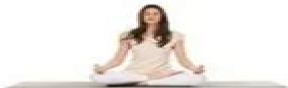
6. Easy Pose