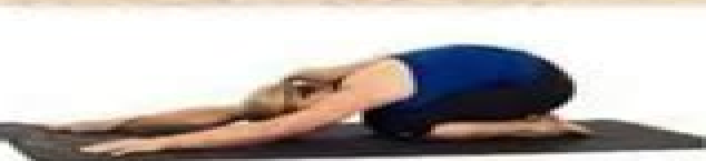
1. Child's Pose