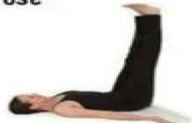
13. Legs Up the Wall Pose