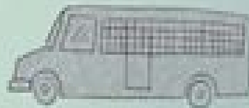
Transport and manage prisoners