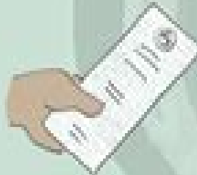
Serve court documents