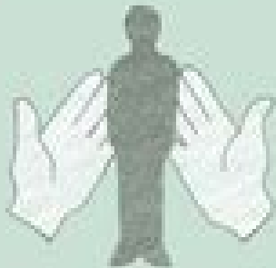
Protect federal witnesses