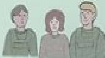
Protect members of the federal judiciary