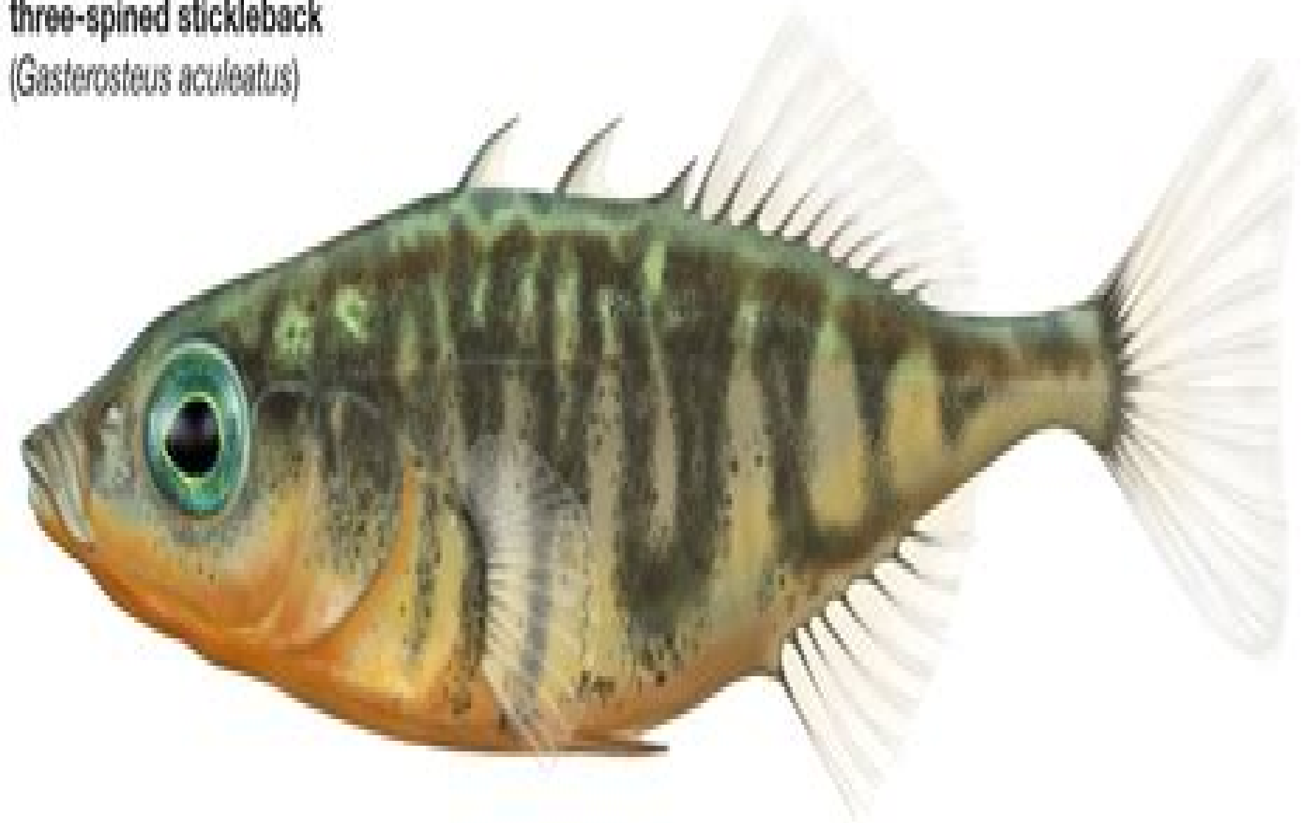
three-spined stickleback ( Gasterosteus aculeatus )