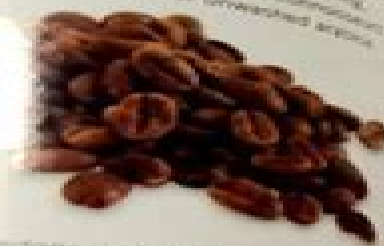
...washed Java Jember coffee beans.

...land, grows the most famous coffee in the world - the Sumatran Mandheling. This is a very famous coffee, which is very famous, and is produced in the high mountains of Sumatra. One of the few ways and ways to produce and produce coffee in Sumatra is to grow it in the high mountains of Sumatra. The coffee is generally not quite as good as the Mandheling from the high mountains, but it is still a very good coffee. The coffee is also known as the 'Sumatran Mandheling' and is very famous. The coffee is also known as the 'Sumatran Mandheling' and is very famous. The coffee is also known as the 'Sumatran Mandheling' and is very famous.