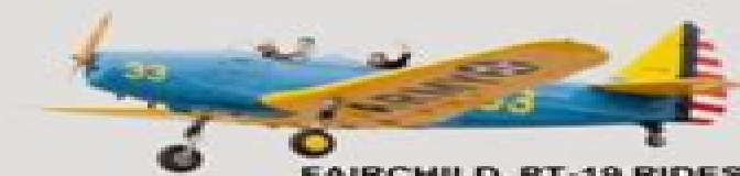
FAIRCHILD PT-19 RIDES