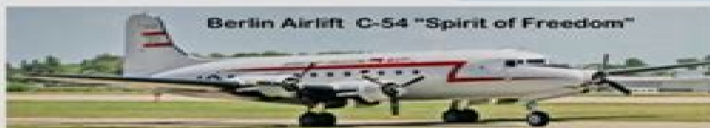
Berlin Airlift C-54 "Spirit of Freedom"

Hagerstown Aviation Museum Aircraft Exhibits: Fairchild C-82 & C-119 Flying Boxcar, C-123K, PT-19 Airplane Rides, Capital Wing of the Commemorative Air Force Fairchild UC-61 and Stearman Biplane Rides!