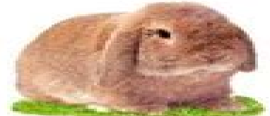
DWARF LOP FAWN