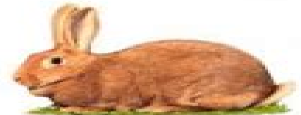
NEW ZEALAND RED