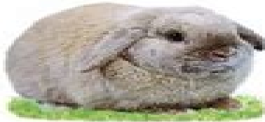
DWARF LOP BLUE