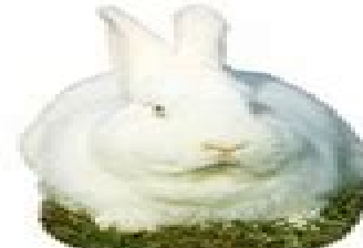
NEW ZEALAND WHITE