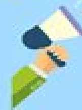
SPREAD THE WORD