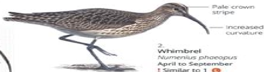
2. Whimbrel Numenius phaeopus April to September ! Similar to 1