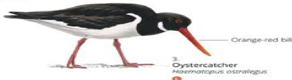
3. Oystercatcher Haematopus ostralegus