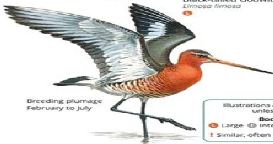
Breeding plumage February to July