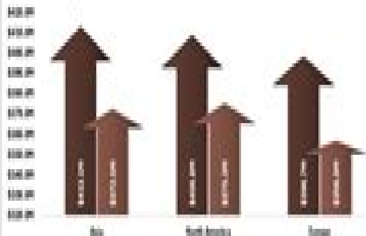
Budget (USD) Vs Revenue (USD) by Region