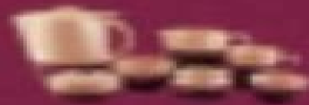
The Gunning Earthenware Co.