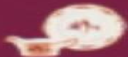
The Atlas-Globe China Co.