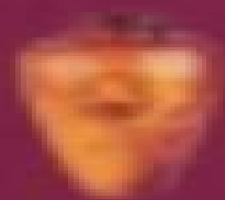
Cambridge Art Pottery