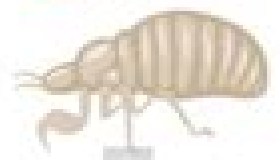
Nymph Tiny nymph fall to the ground