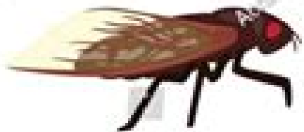
Adult Spend their adult lives only a few weeks for a mate