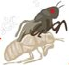
Shedding Climb the nearest tree and shed their nymph exoskeleton