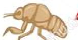
Nymph Get nutrition by sucking on roots of tree and shrubs for 17 years