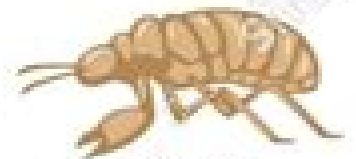
Nymph Get nutrition by sucking on roots of tree and shrubs for 17 years