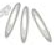
Lay Eggs She can lay up to 600 eggs