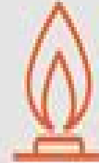
Natural Gas (NGAS.MMMYY)