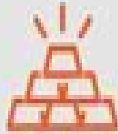
Gold (GOLD_MMMYY & XAUUSD )