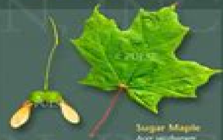
Sugar Maple Acer saccharum