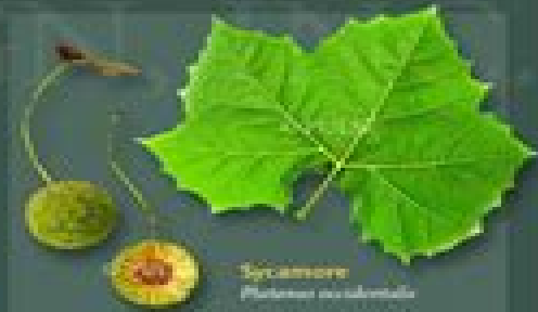
Sycamore Platanus occidentalis