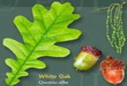
White Oak Quercus alba