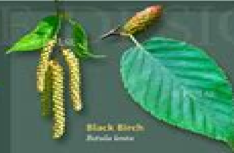
Black Birch Betula lenta