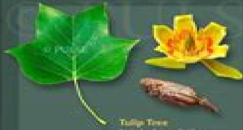
Tulip Tree Liriodendron tulipifera

Look For These Common Trees In Your Woods