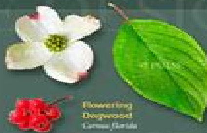
Flowering Dogwood Cornus florida