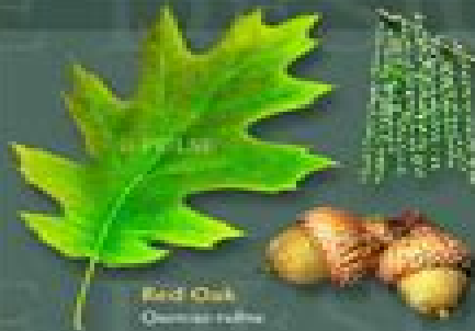
Red Oak Quercus rubra