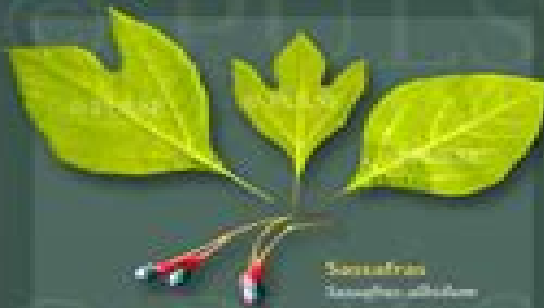
Sassafras Sassafras albidum